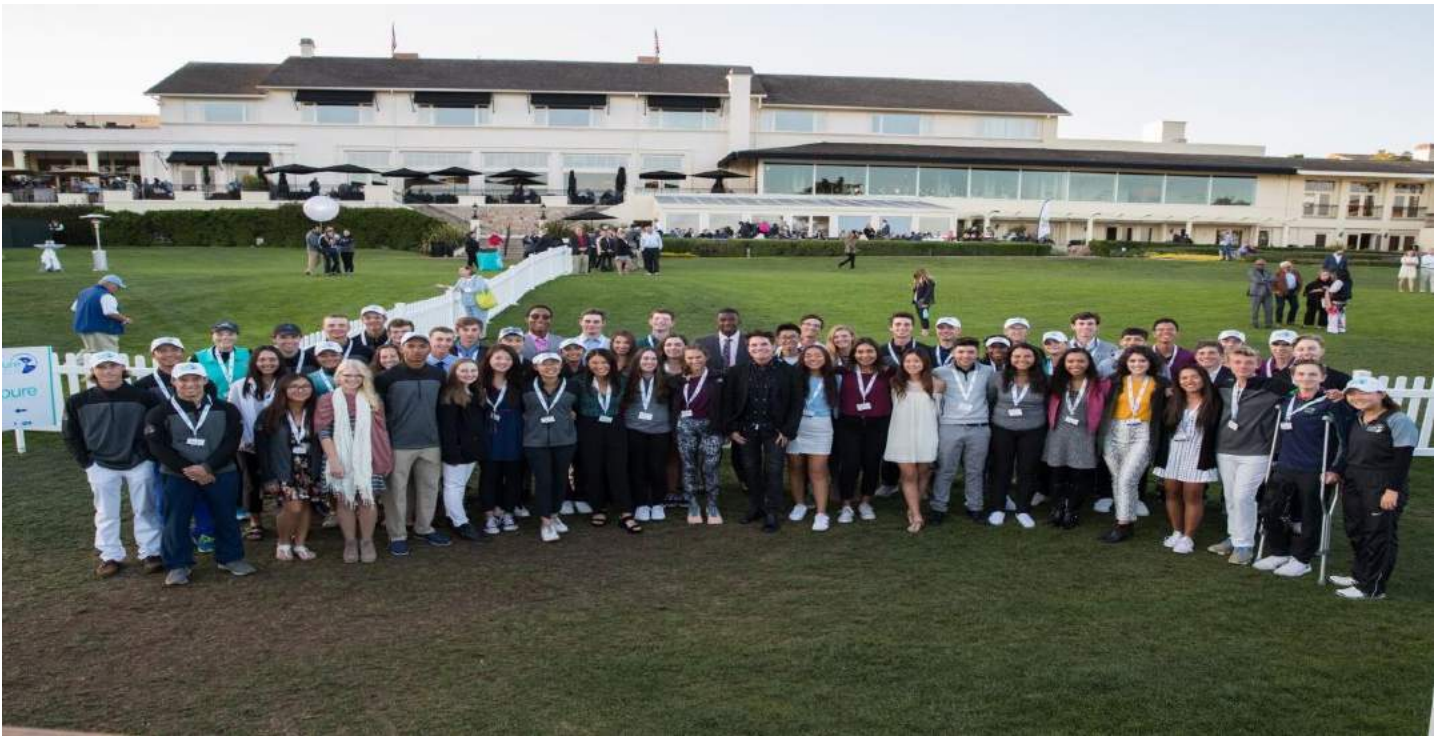
Pictured here with their fellow 2018 First Tee Participants on the lawn near 18 green with the Pebble Beach Lodge in the background; both of these amazing young Montgomery County juniors, brought home memories that will last lifetimes; and have a ton to be proud of.